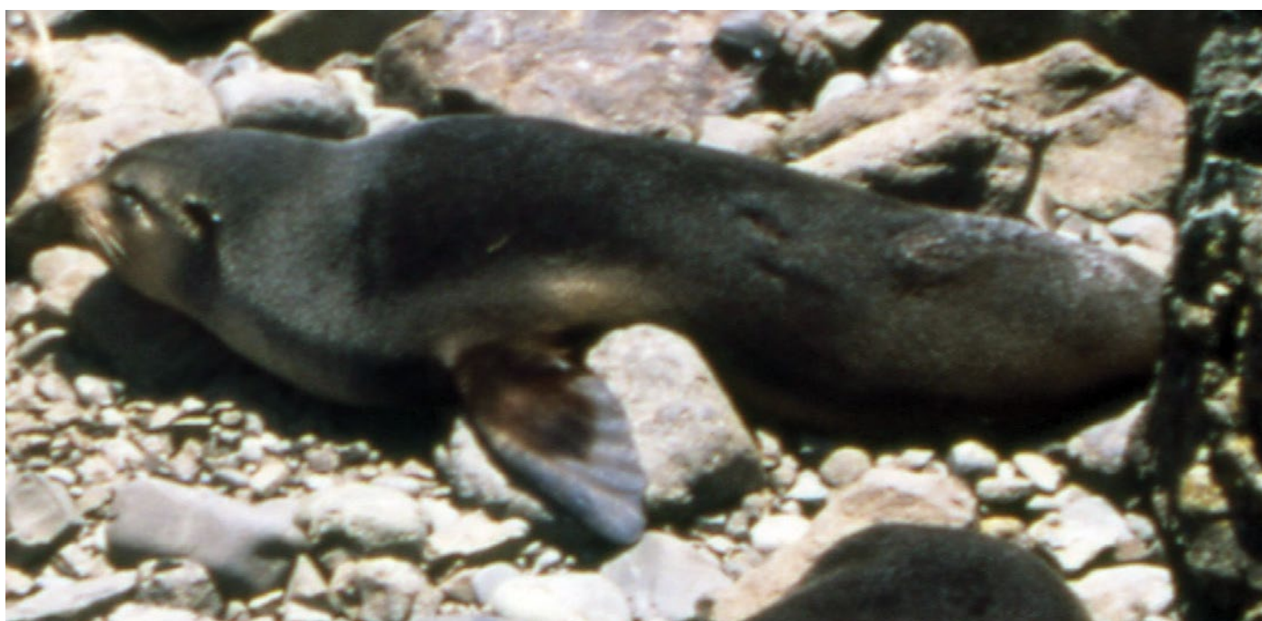
Subantarctic fur seal.