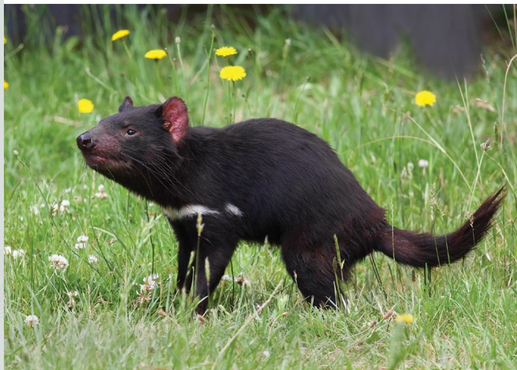
RIGHT: Tasmanian devil.

These indices will allow Australian governments, non-government organisations, stakeholders and the community to better understand and report on which groups of threatened species are in decline by bringing together monitoring data. It will potentially enable us to better understand the performance of high-level strategies and the return on investment in threatened species recovery, and inform our priorities for investment.